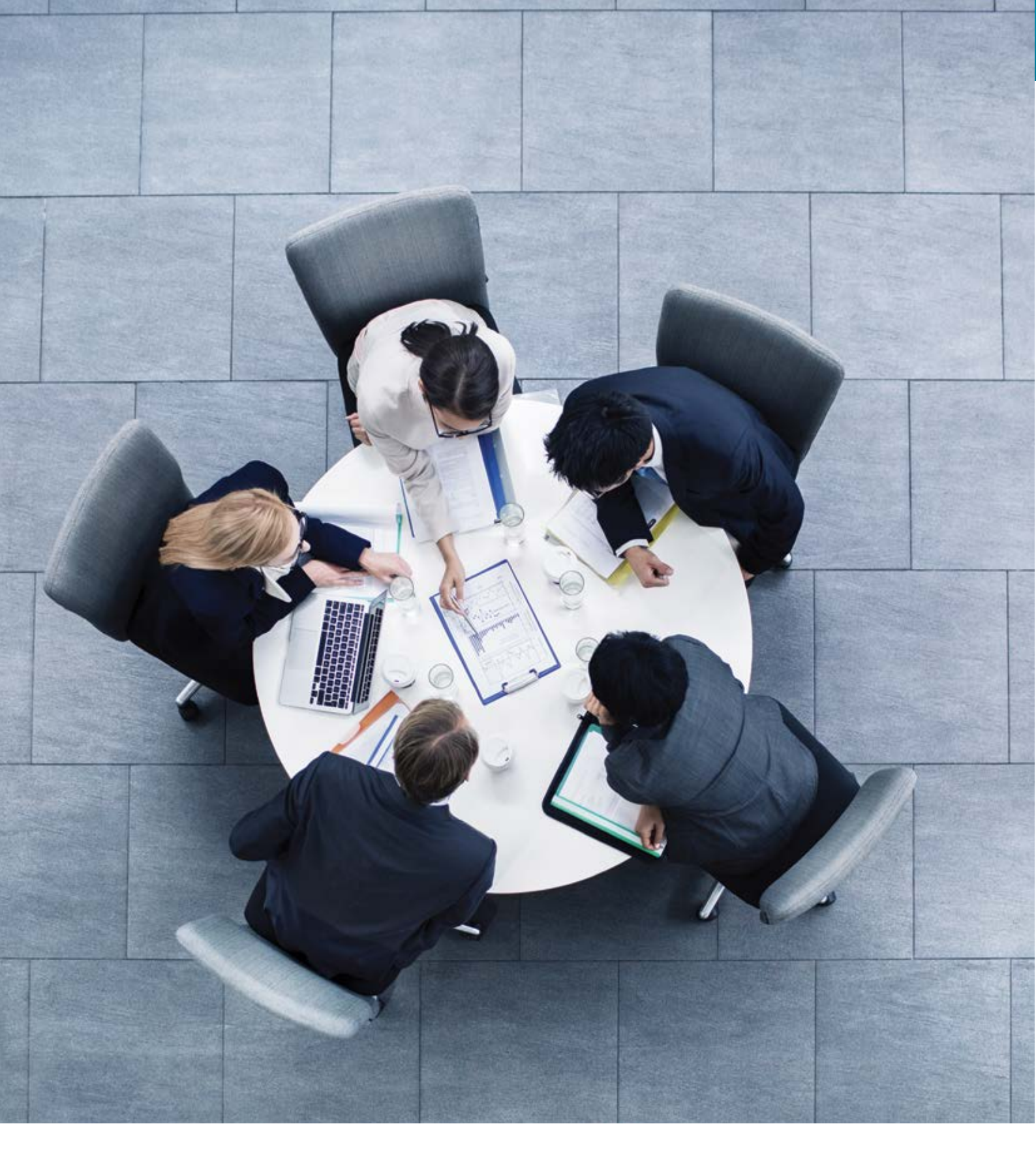
Epicor ERP eliminates complexity, making ERP easier to use, more collaborative and more responsive.